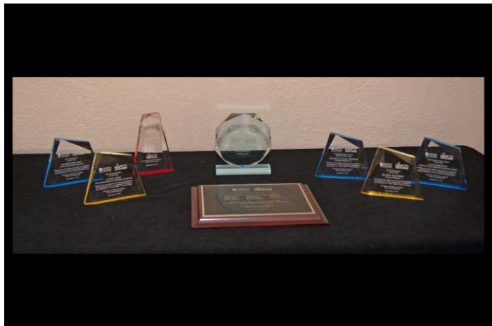
Awards presented at the 2011 Annual Table Top

For submission packets, and more details, please visit: http://www.napco.org/awards.htm